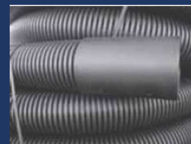
Type TP 360°

Application: Drainage buried in building and civil engineering works. Standard: UNE 53994 - C2 ED Joint system: Sleeve Mercado: According to specification Color: Black, other colors consult Availability: - In rolls of 50 m DN 110 tubes - In rolls of 25 m DN 160 tubes - In bars of total length 6 m